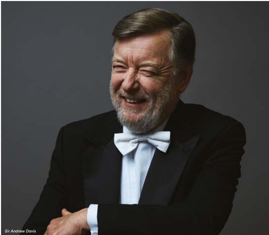
Sir Andrew Davis

Lu Siqing joined Sir Andrew and the MSO on a 2018 tour of China, where the Orchestra performed Bruch's Violin Concerto and Tchaikovsky's Sixth Symphony, Pathétique , to six rapturous standing ovations across the country. Be the first in Australia to see this program performed by two stars, as well as your Melbourne Symphony Orchestra.