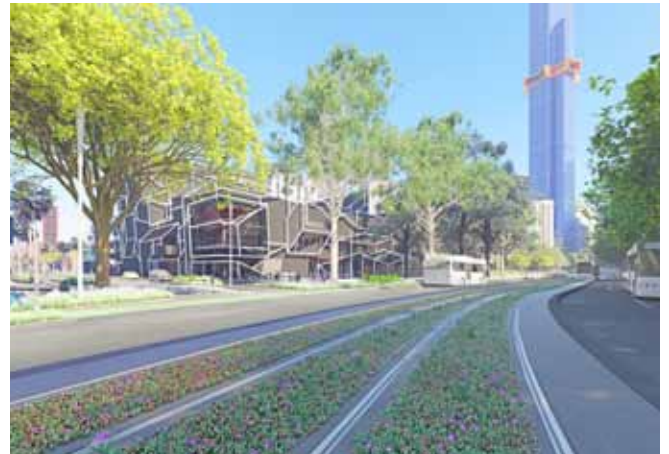
Artist's impression of completed landscape between St Kilda Road and Sturt Street

Southbank Boulevard between St Kilda Road and Sturt Street will gradually re-open in early 2019.